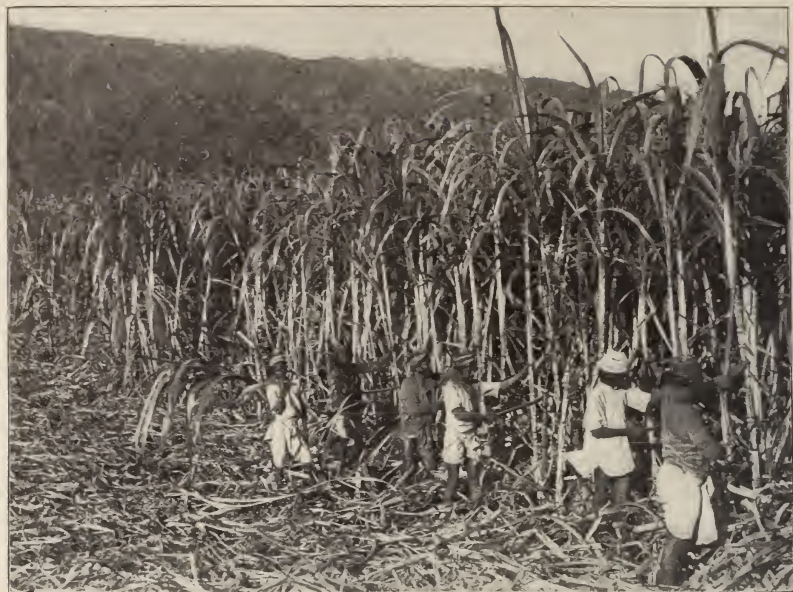
A FIELD OF SUGAR CANE IN ZULULAND